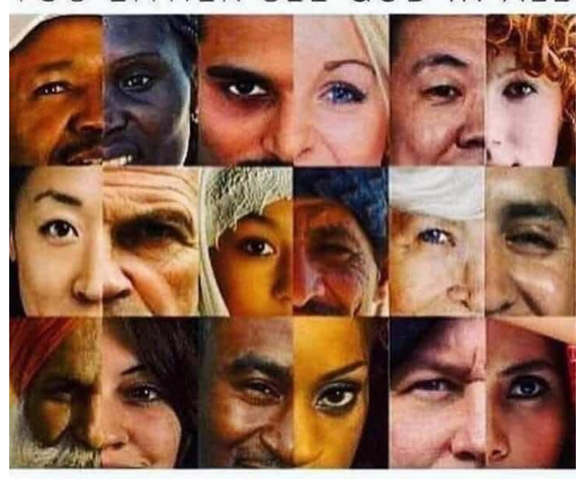
OR DONT SEE GOD AT ALL